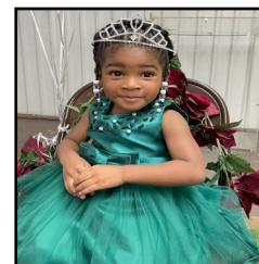
Little Miss COCO